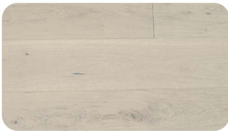
Winter Oak 0102