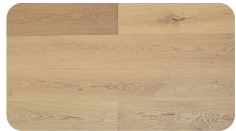
Amber Oak 0101