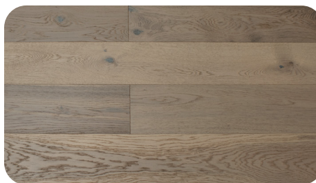
Log Haven 0201