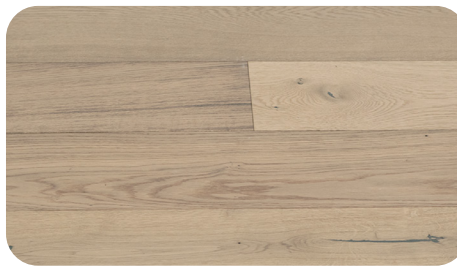
Au Naturele 0103